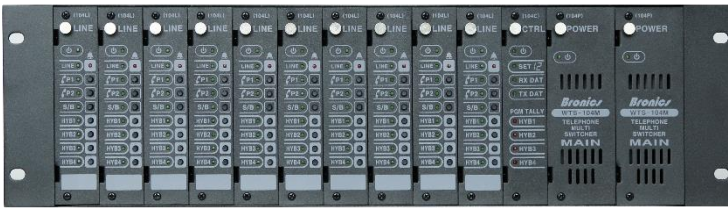
WTS-104M Main Unit