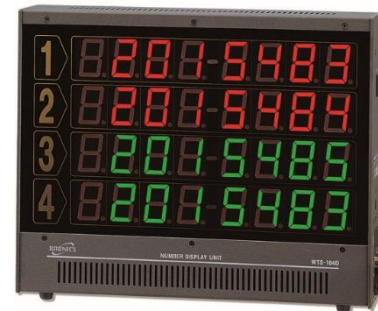
WTS-104D Number Display Unit

본 시스템은 최대 10회선의 전화회선을 수용하여 방송시스템에 접속 및 분리하는 장비로써, 전화회선의 접속상태, 대기상태, 그리고 방송 ONAIR 상태 등 다양한 운용상태를 손쉽게 확인 및 제어가 가능한 시스템이다.