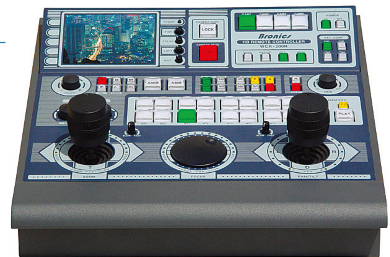
WCR-200R Remote Controller