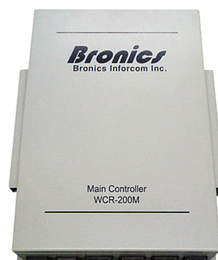
WCR-200M Main Controller