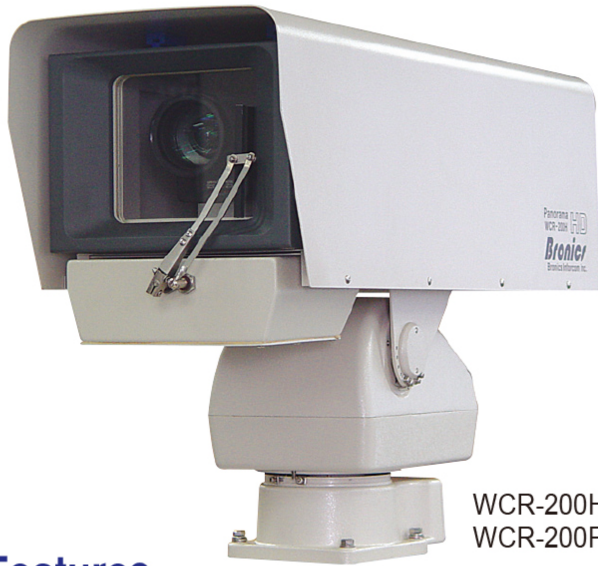
WCR-200H Housing & Control System WCR-200P PAN/TILT Drive