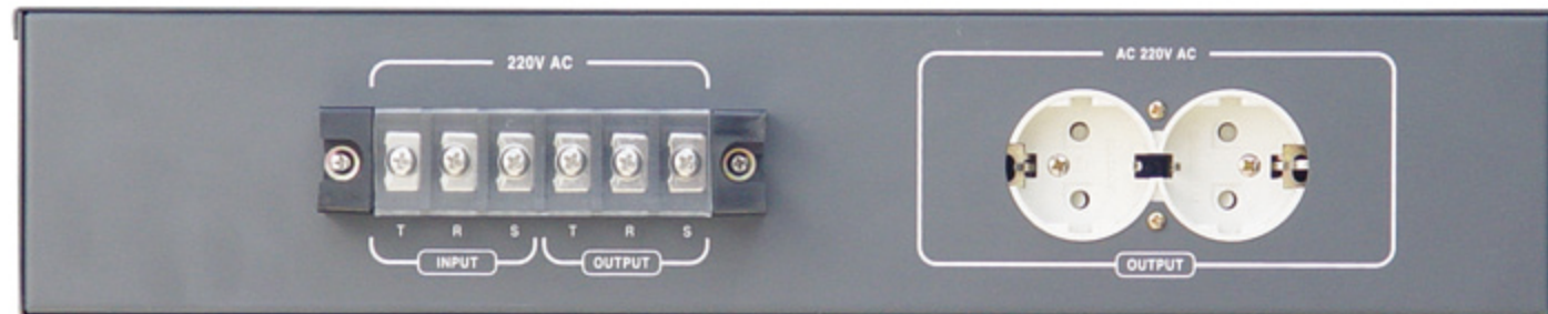
WPU-201D (220V & Ampere Meters)