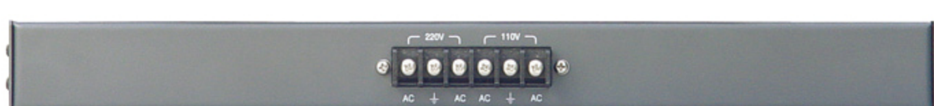
WPD-202C (220V & 110Volt Display)