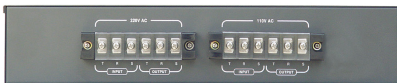
WPU-202D (220V & 110Volt Meters)