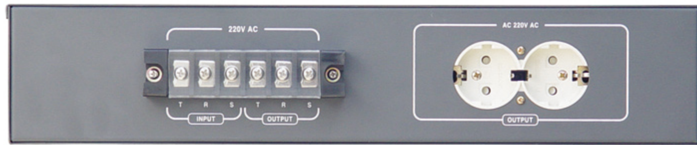
WPU-220 (220Volt Meter)