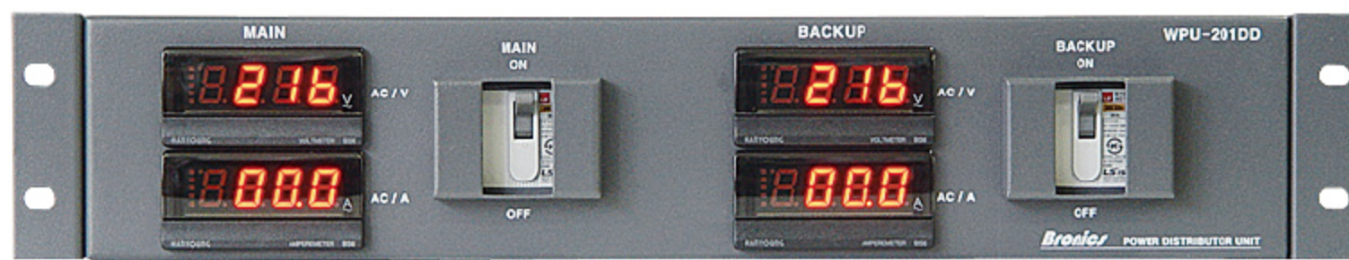
Volt Ampere Volt Ampere